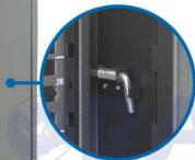
L Tower Bolt Lock Inside